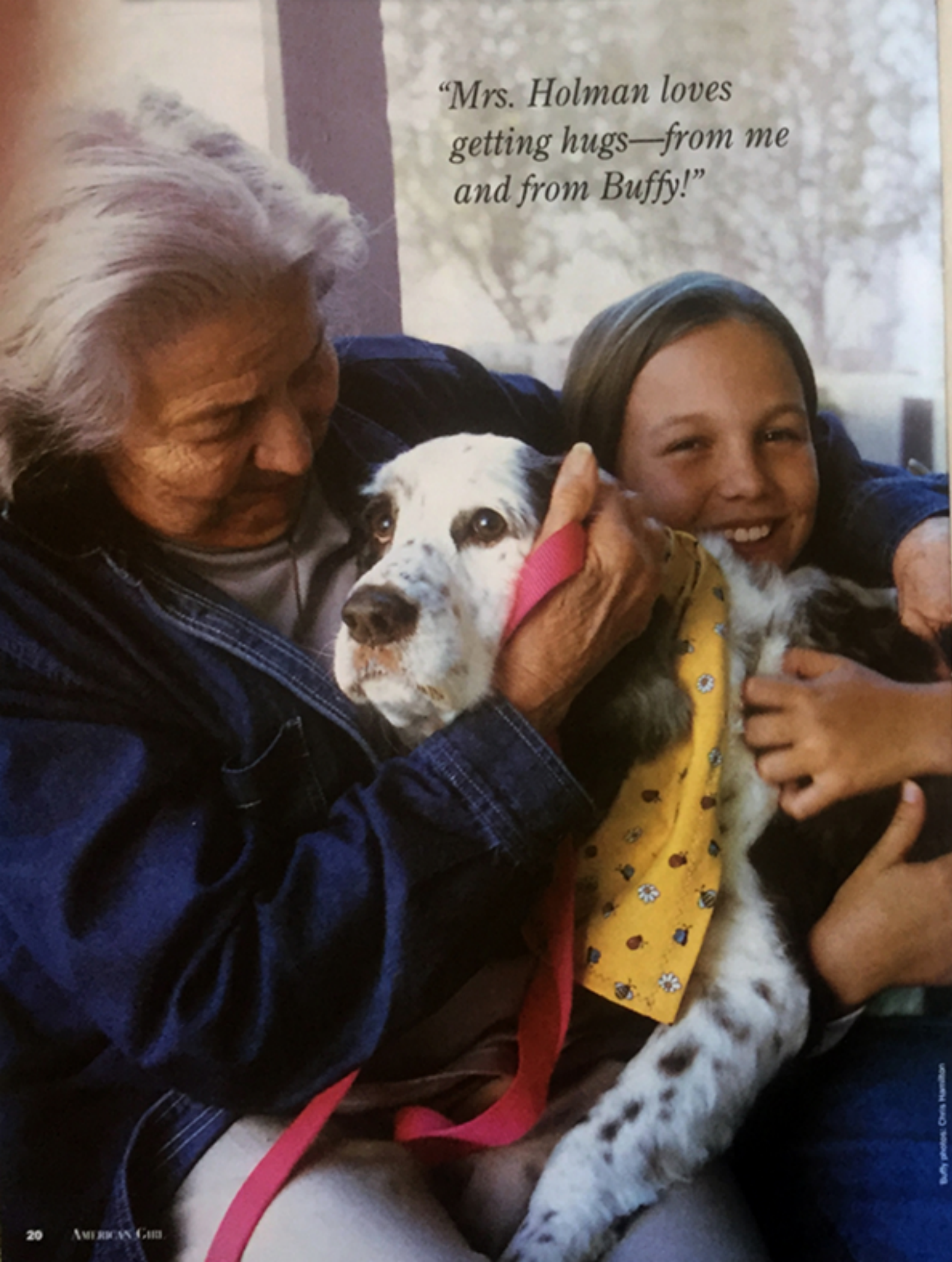
Buffy