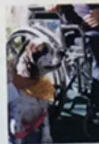
Any calm pet can be a Pet Partner.