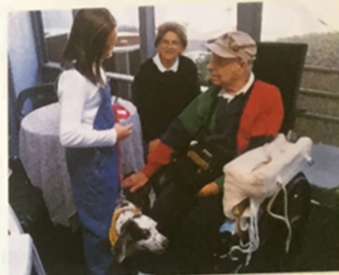
As you can see, Buffy makes friends fast!